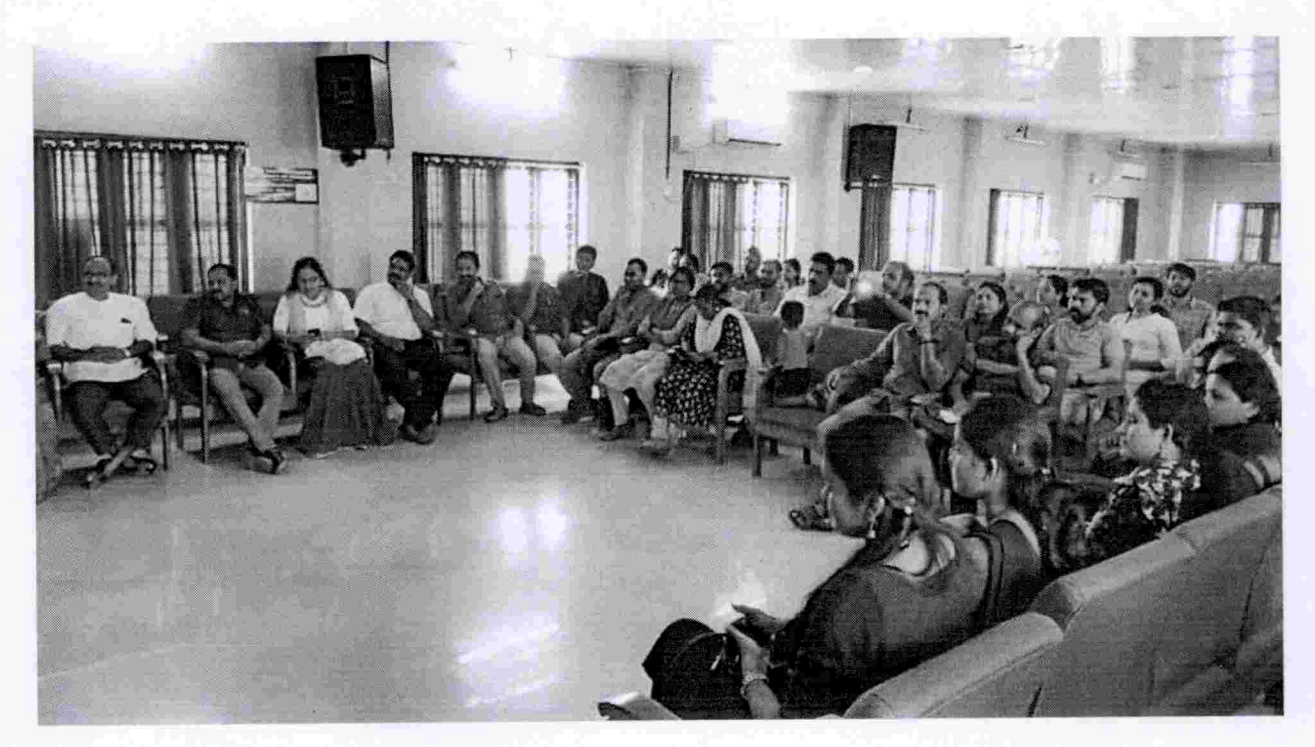
From group interactions.....