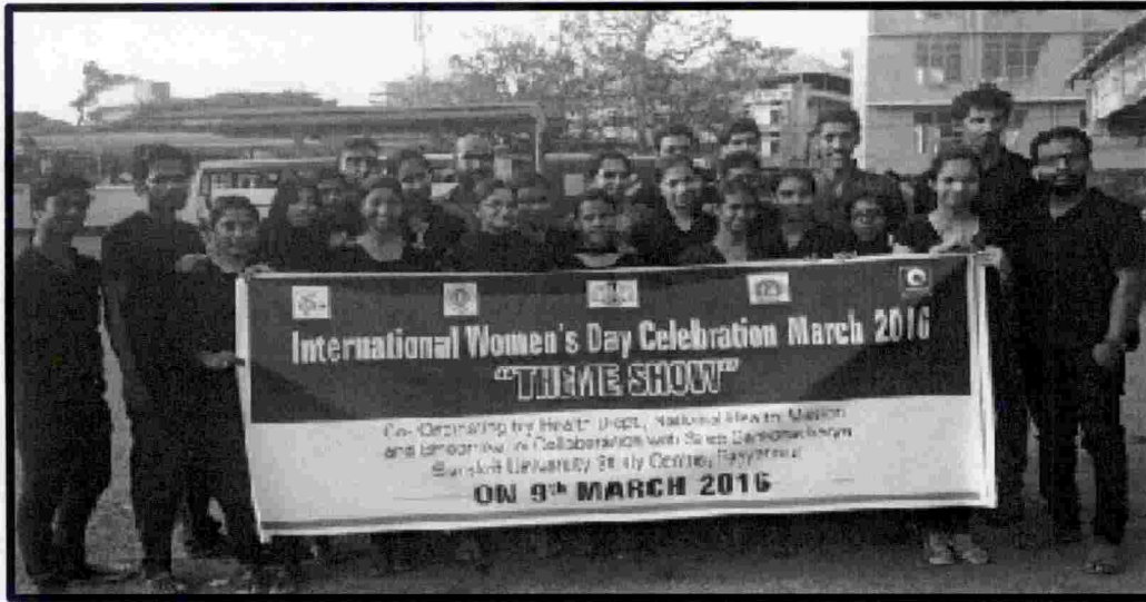
Women's Day celebration at RC Payyannur on 09.03.2016

In addition to the regular day observances at the Regional Campus- Payyannur, the students performed a theme show at KSRTC bus stand, Kannur, on International Women's day in collaboration with National Health Mission, Kannur.