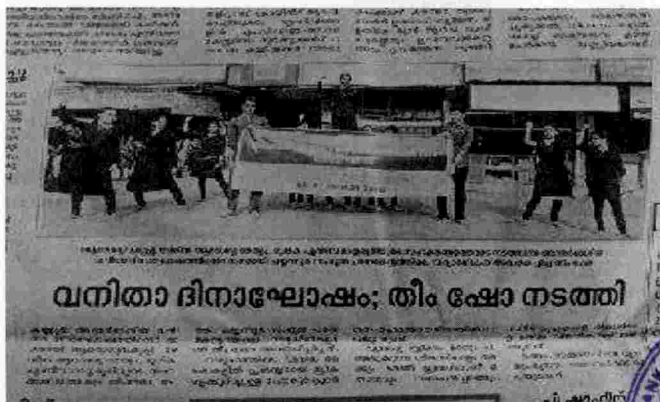
Women's Day celebration on 9/3/2016

A documentary was prepared by the students of department of sociology on behalf of women's day celebration. The theme of the programs was women's freedom. The students split into different groups and collect the bit for this documentary. They collected the statements and arguments regarding women's freedom from faculties, non-teaching staff, research scholars and post graduate students of the university campus. The responses were interesting and exciting as it covers different perspectives of women's freedom. The experiences through this make the students aware about the current social situations regarding women's social status in the current society. Even it makes them to critically think about the philosophical position of the term "women's freedom". The collected bits stating the notion of women's freedom compiled together to form a documentary.