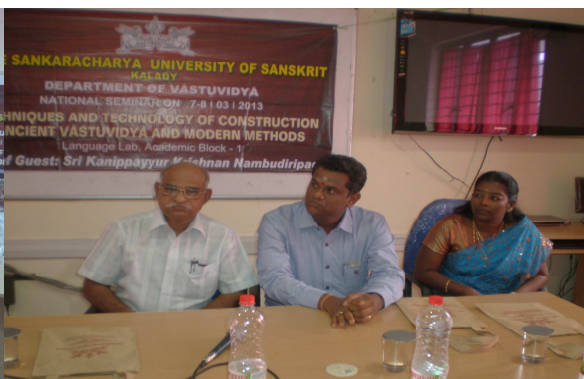
National Seminar on Techniques and Technology of construction: A comparison between ancient Vastuvidya and modern methods Organized by Dept, of Vastuvidya