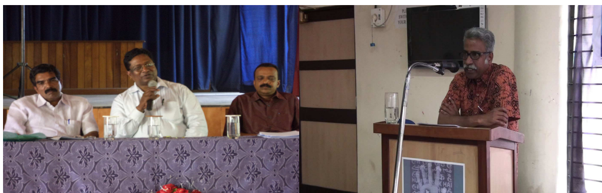
National Seminar on Perspectives on Cochin organized By the Department of History