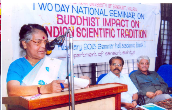
Buddhist Impact On Indian Scientific Tradition National Seminar organized by Dept. of Sanskrit Sahitya