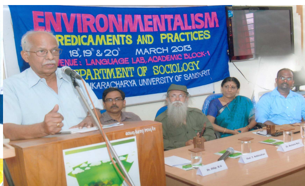
National Seminar on "Environmentalism" organized by the Dept. of Sociology