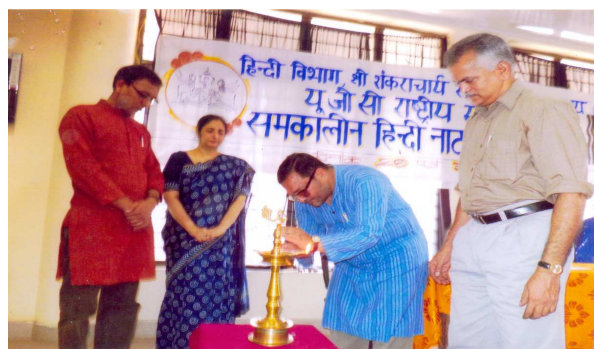
National Seminar on Samakaleen Hindi Natak Ke Aayam Organized by Dept. of Hindi