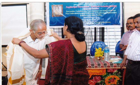
Panditha Samadharanam in connection with Kalakkath Govindan Nambiar Endowment Lecture organized by the Dept. of Sanskrit Vyakarana