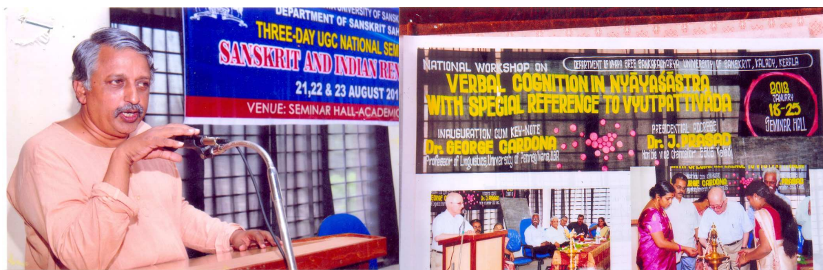
National Seminar on Sanskrit and Indian Renaissance organized by the Dept. of Sanskrit Sahitya