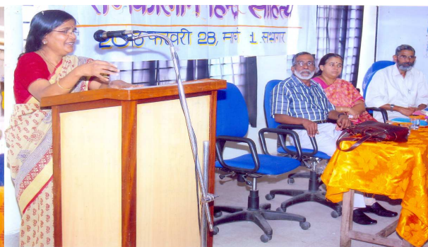
National Seminar on Sthree Vimarsh Aur Samakaleen Hindi Sahitya Organized by Dept. of Hindi