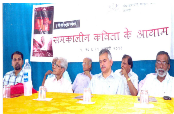
National Seminar on Samakaleen Hindi Kavita Ke Aayam Organized by Dept. of Hindi