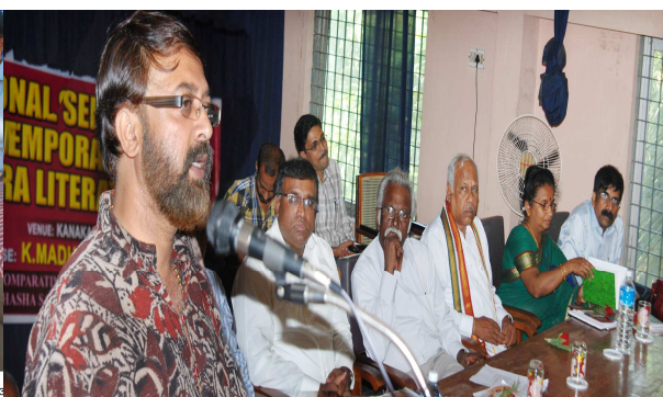
International Seminar on Contemporary Diaspora Literature organized by Centre for Comparative Literature