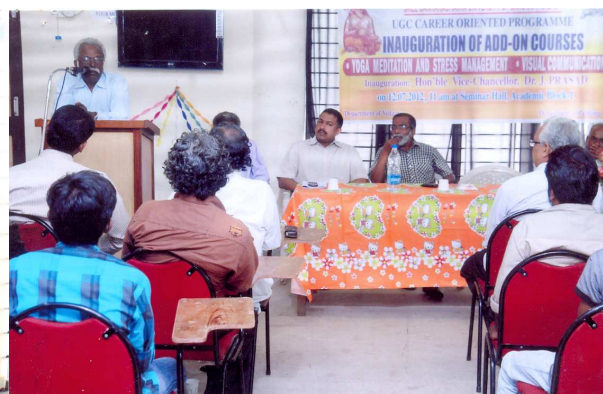
Inauguration of Add-on Courses: UGC Career Oriented Programme organized by Dept. of Sanskrit Vedanta and Dept. of Painting