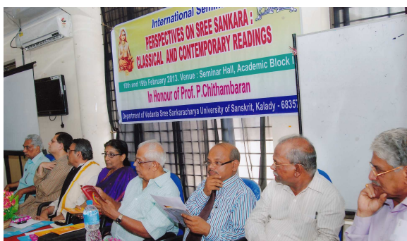
International Seminar on Perspectives on Sankara Classical and Contemporary readings organized by Dept. of Sanskrit Vedanta