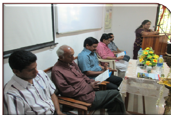
Workshop on Counselling and Behaviour Therapy organized by the Dept. of Psychology