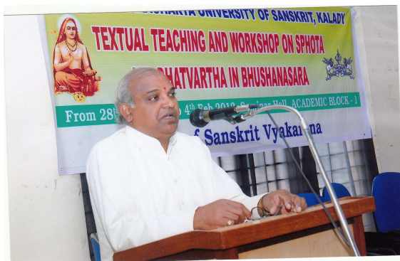
Textual Teaching and Workshop on Dhatvartha and Sphota in Bhushanasara organized by Dept. of Sanskrit Vyakarana