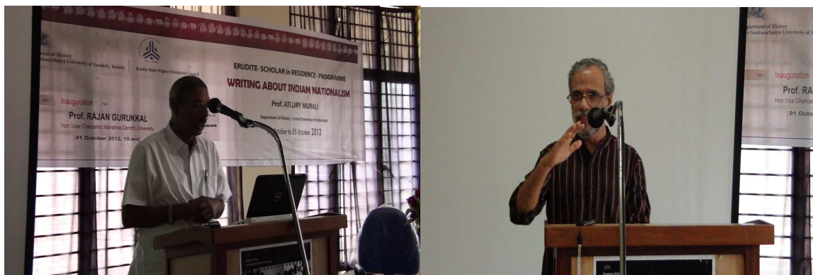
Erudite Scholar in Residence Programme on Writing about Indian Nationalism organized by the Dept. of History