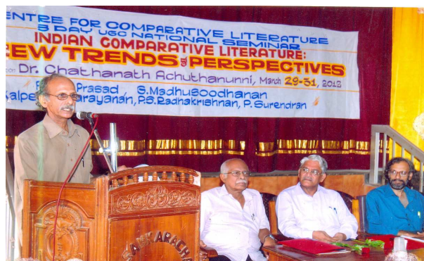
National Seminar on Indian Comparative Literature: New Trends and Perspectives organized by Centre for Comparative Literature