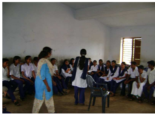
AWASS (Alliance for Work and Awareness by Social Work Students)