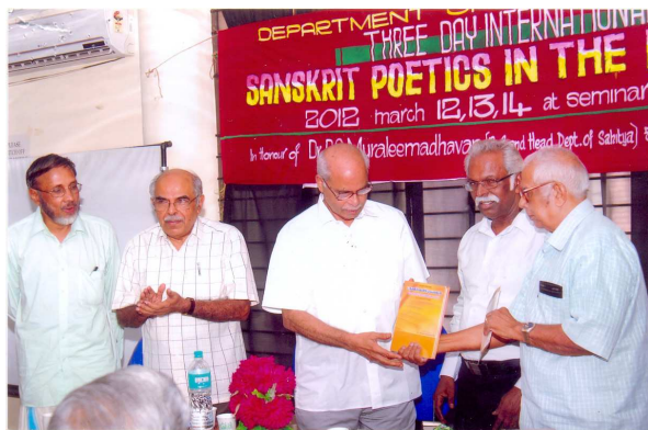
International Seminar on Sanskrit Poetics in the Post Modern Scenario organized by Dept. of Sanskrit Sahitya