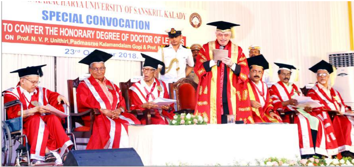
► The Chancellor Justice (Retd) P. Sathasivam speaking at the Special Convocation ceremony.