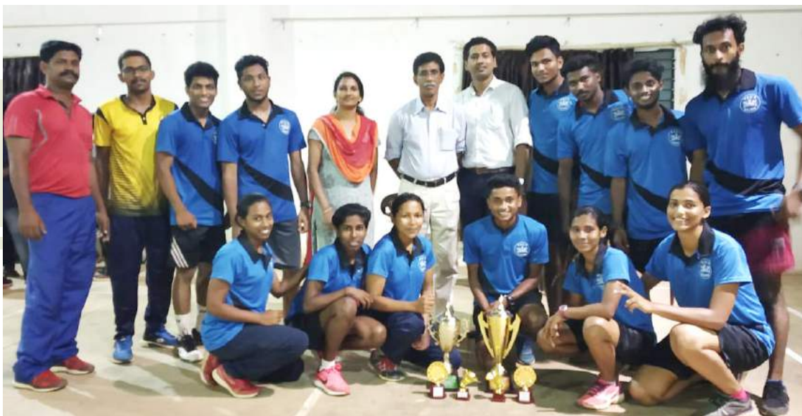
► Winner of the inter-centre badminton championship

The inter-centre championship 2018 for the men's and women's categories was held at Kalady main campus. Kalady main centre team won the first prize and Koilandy regional centre team won the second prize for the men's category (doubles). Whereas, Kalady main centre team secured the first prize