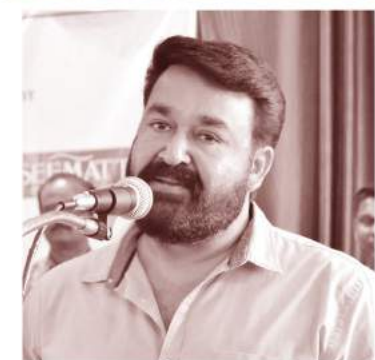
► Padma Shri Dr. Mohanlal

Padma Shri Dr. Mohanlal Vishwasanthi Foundation, named after his parents, in collaboration with the textile conglomerate Seemati distributed coupons to flood affected