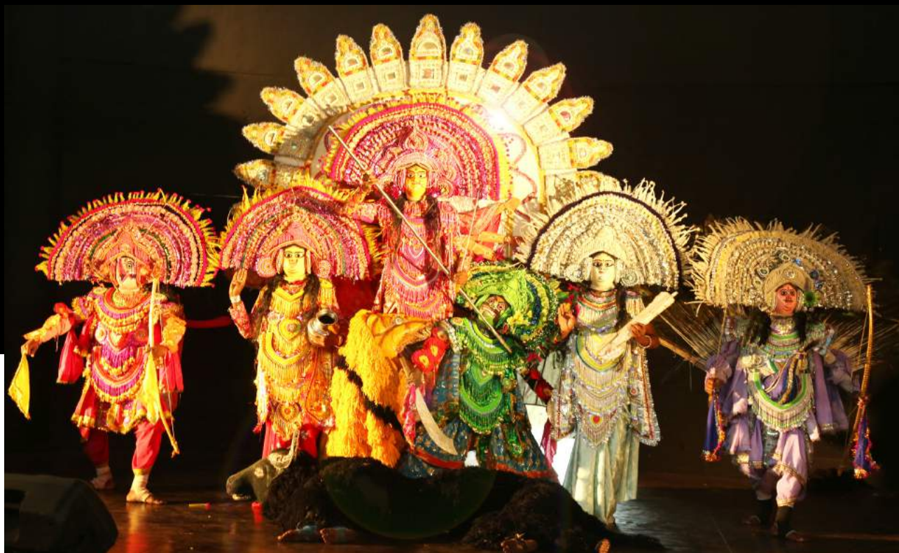
► 'Purulia Chhau' performance at the university Koothambalam.

The Department of Dance staged West Bengal's much famed traditional art-form 'Purulia Chhau' at the university Koothambalam. The semi-classical dance form incorporating martial, tribal, and folk