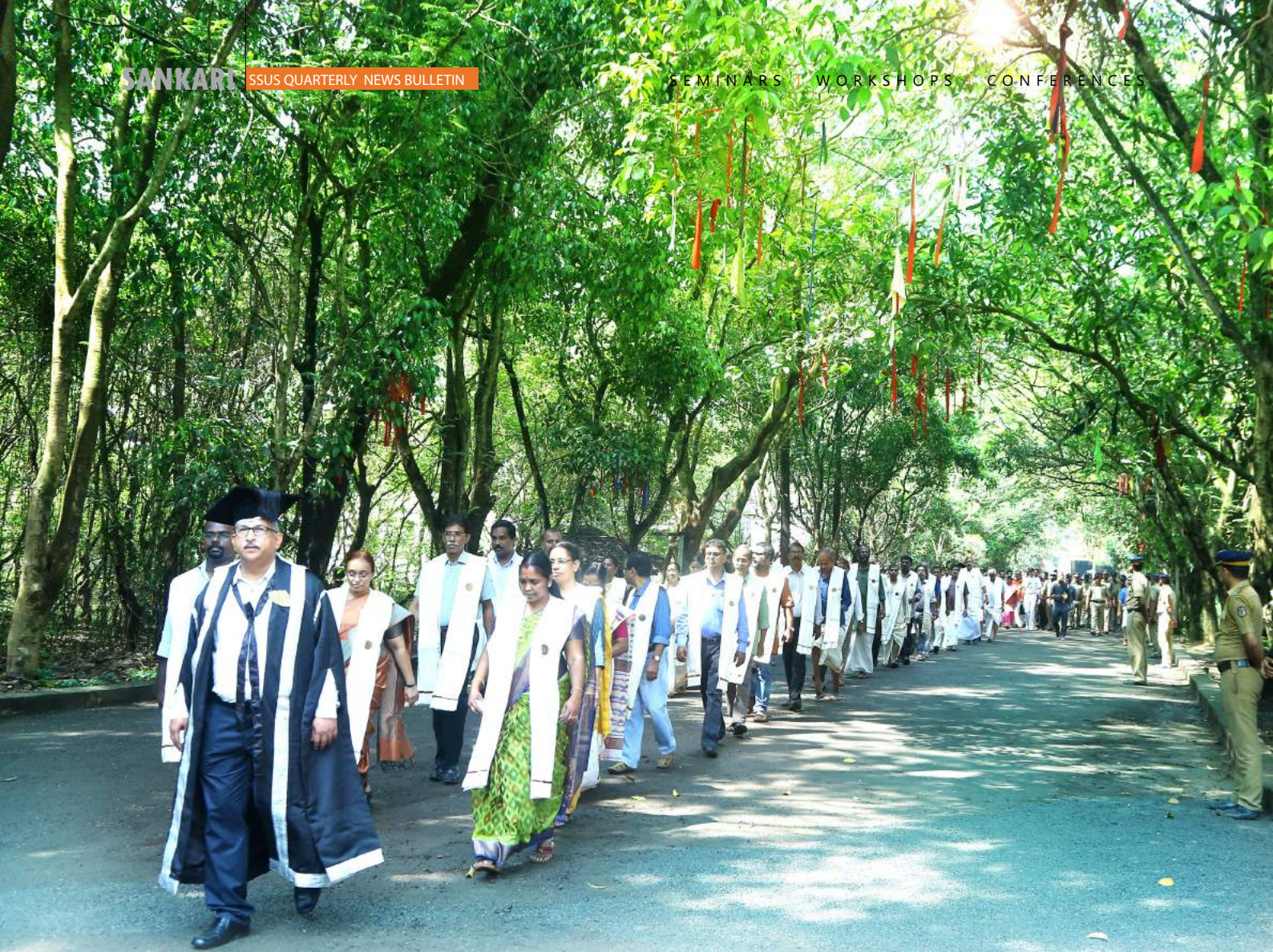
► Academic procession