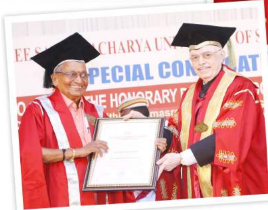
► Padmashri Kalamandalam Gopi receiving the D-Liitt degree from the Chancellor Justice (Retd) P Sathasivam