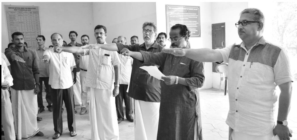
► The university community taking the oath on Kerala Formation Day.