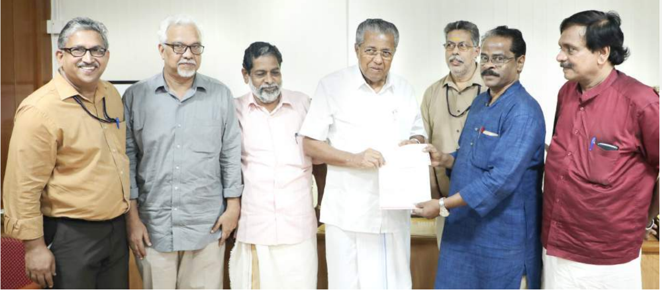
► Vice-Chancellor handing over the cheque to the Chief Minister

Despite being the lone higher education institution in the state to have suffered massive losses (over 7 crore) in the August flood, the varsity community was generous and socially committed to donate copiously to the Chief Minister's Disaster Relief Fund. The varsity community contributed a sum of INR 1,12,99,926 as the first instalment of donation.