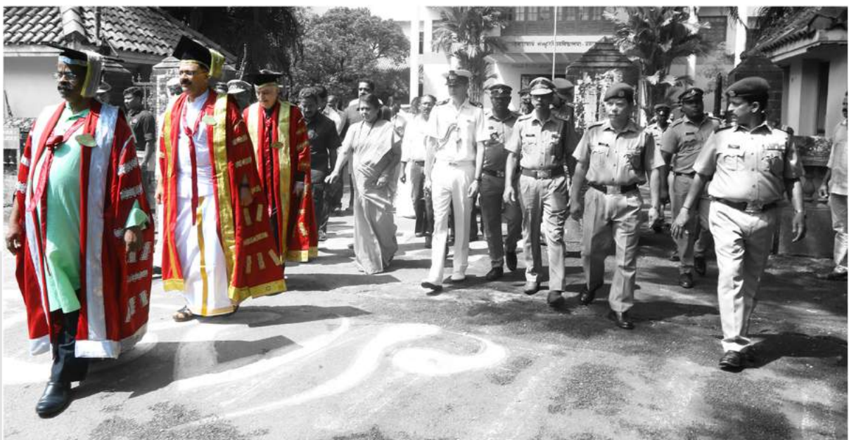
► Academic procession