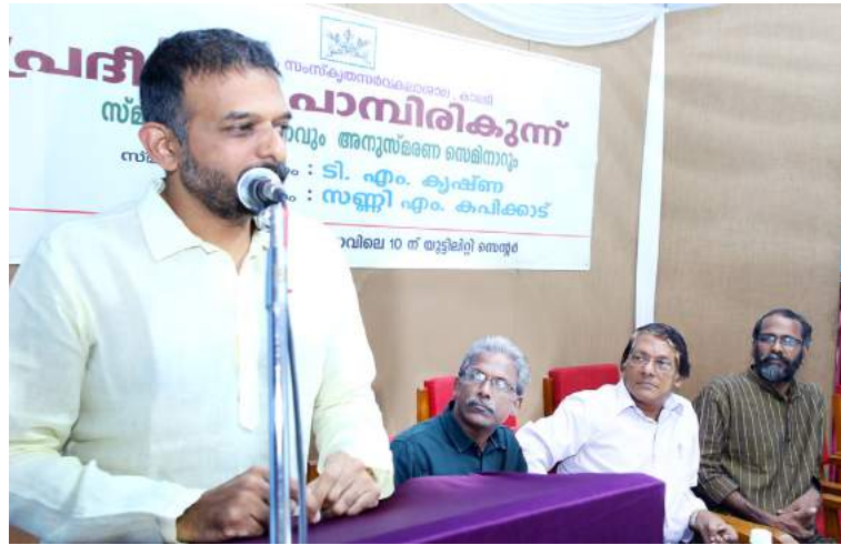
▶ T. M. Krishna speaking at the event.