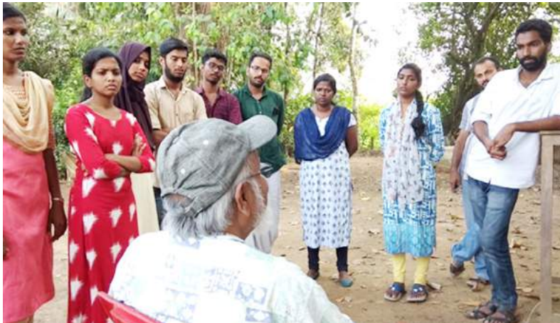
▶ Students during the field visit to SC colony in Neduvannor, Nedumbaserry gramapanchayat. The areas were severely affected by the august floods.