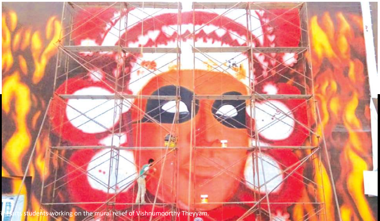
► Fine arts students working on the mural relief of Vishnumoorthy Theyyam.