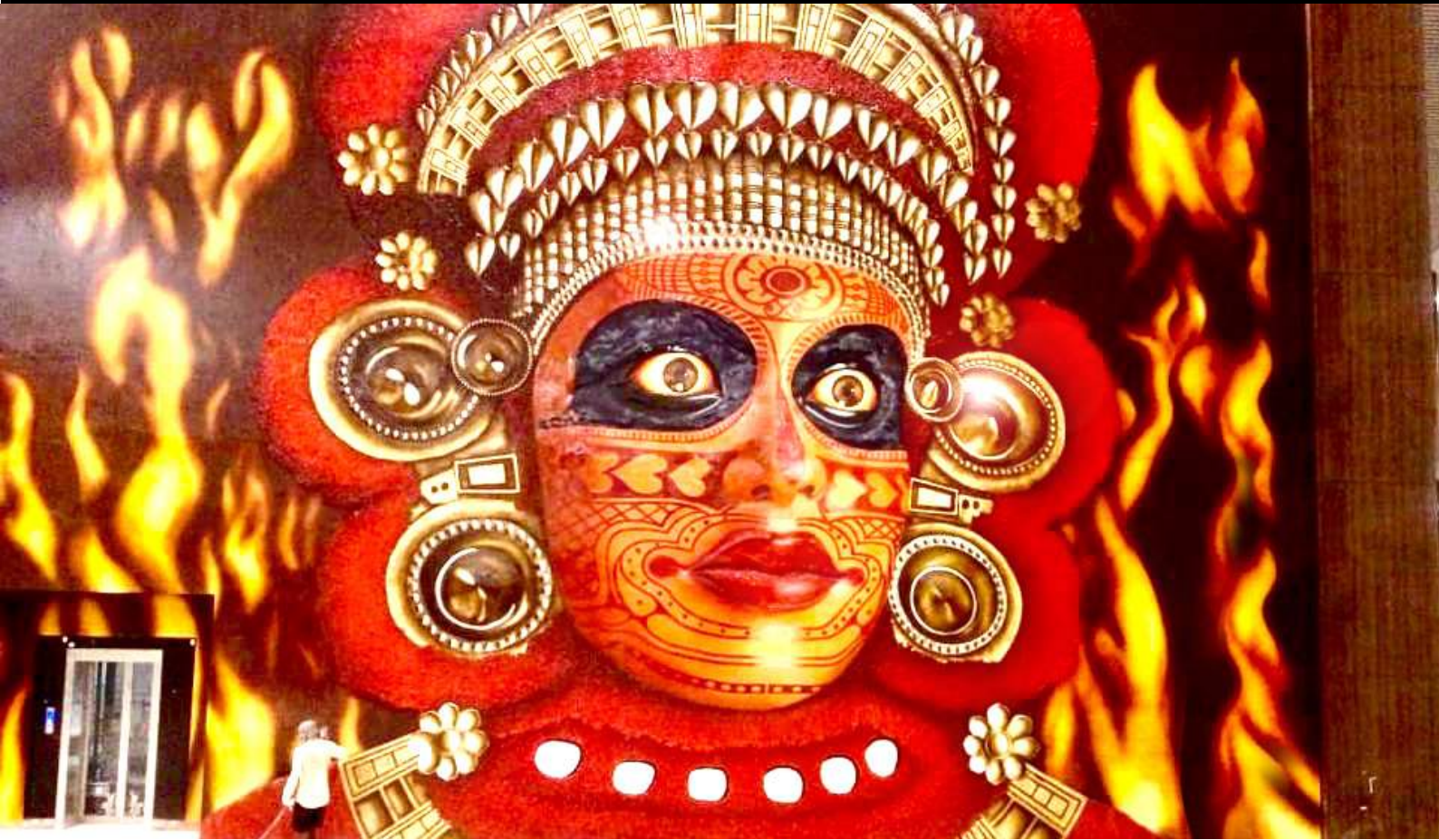
► Vishnumoorthy Theyyam at Kannur International Airport.

The artistically designed Kannur International Airport Limited (KIAL) adorns the cultural heritage, uniqueness and beauty of Malabar. Among the many art-forms at the airport, the mammoth mural relief of Vishnumoorthy theyyam done by the Fine Arts Consortium of the Sree Sankaracharya University of Sanskrit becomes the lodestar of attraction.