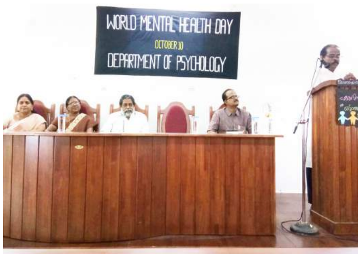
► Vice-Chancellor speaking during the inaugural session.