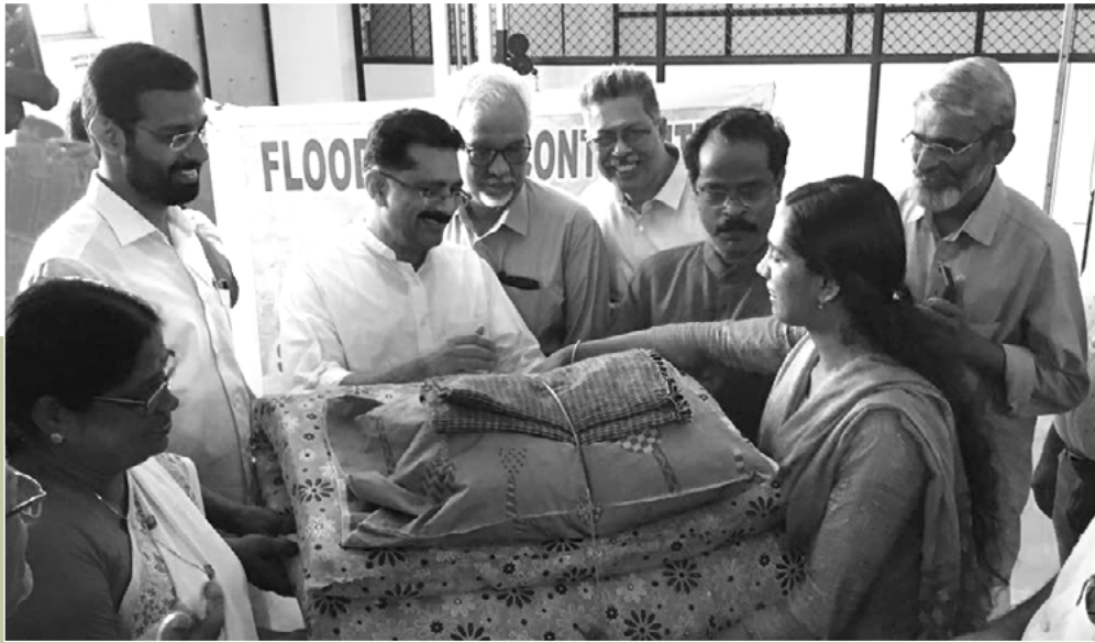
► Higher Educational Minister Dr. K T Jaleel distributed the relief kits to the students.

The whole looks upon how Kerala undertook the massive rescue and relief operations. Many world nations take Kerala as the paramount example for unity, and the presence of mind the people showcased on face of a calamity. When the inundated university seeks for help, the varsity's alumni associations were among the first to act upon. The department of Social Work Australian Alumni gathered around 250 relief kits (each kit consists of bed, pillow, bedsheet, pillow cover, bucket and mug) for the students residing in hostels who lost their personal belongings in the deluge.