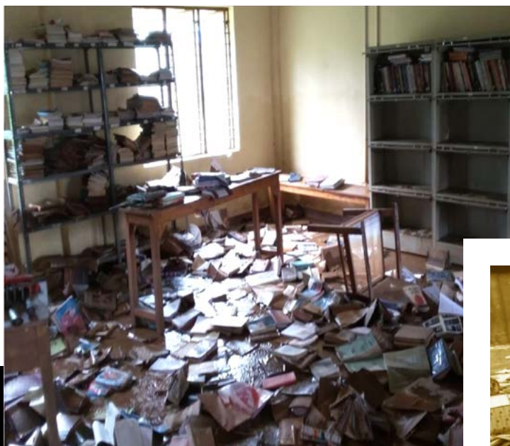
► Hindi department library

The varsity campus tells the tales of soiled books, lost research materials, and murky department libraries that were inundated in the recent floods. The deluge that ravaged the university headquarters at Kalady has caused extensive destruction to the university library, department libraries, and research scholars' hostels.