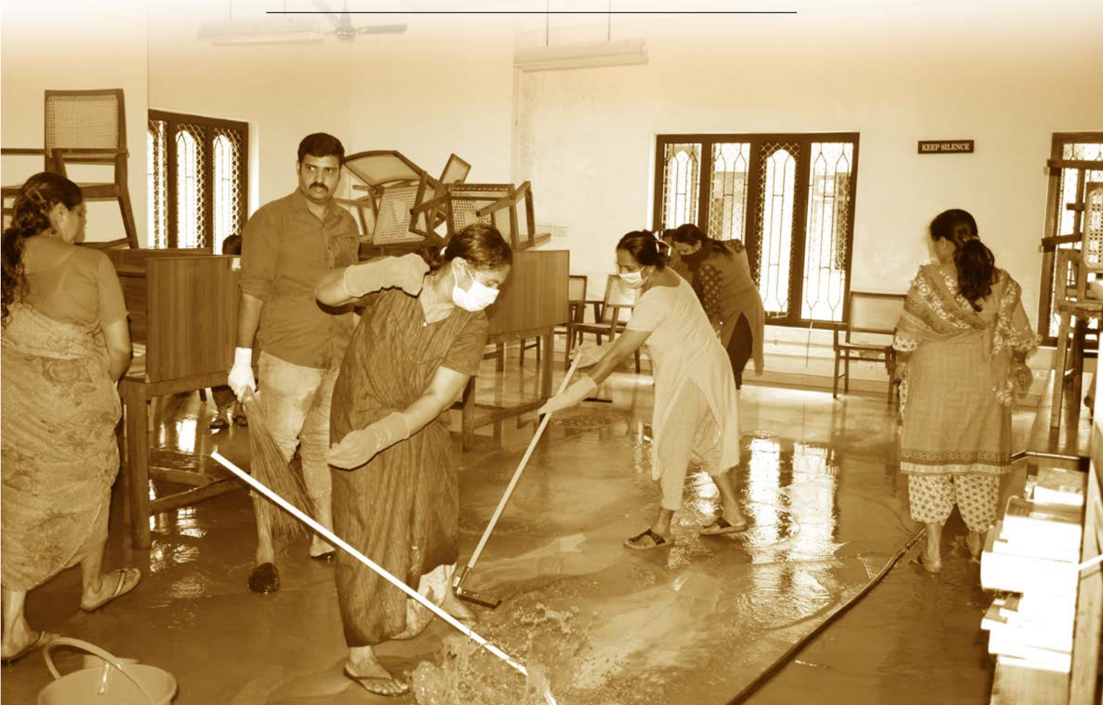
► The university community cleaning the library

All the 24 buildings were flooded in the deluge. This hindered the normal functioning of the varsity and the commencement of classes had to be postponed to the 3rd of September, the actual reopening date being the 29th of August. The functioning of the whole university stalled after the floods created havoc in the entire area. According to the assessment report the institution has suffered damage to the tune of over INR 7,33,63,274 in the inundation. All the generators, control panels in the buildings, the central control panel in the electronics room and water supply systems were fully submerged. It will take at least a fortnight to clean up the administrative block filled with mud and water. Similarly, the engineering wing, Internal Quality Assurance