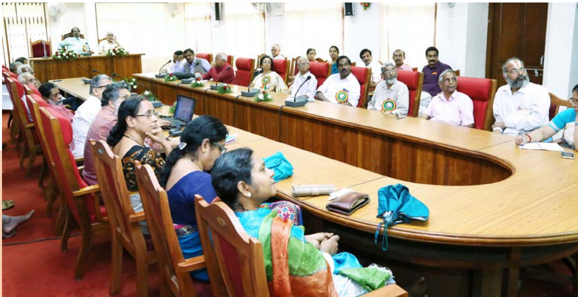
► The Vice-Chancellors and the other delegatas attending the national conference