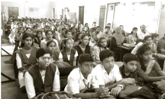
► Scholarship distribution - Punalur

A total of 2508 students were bestowed with Sanskrit scholarship across 41 educational districts in the state. The varsity envisage the motto 'Sanskrit to All' – propagation of Sanskrit by highlighting Kerala's unique secular Sanskrit tradition. An amount of one crore is earmarked for strengthening of Sanskrit for the year 2018-2019. The university is the nodal agency in the propagation of Sanskrit in Kerala. This year the Sanskrit scholarship scheme for meritorious students is being extended to sub district level as well. Books have been listed to be published for making Sanskrit learning easy for students and public. Special orientation programmes are organised for Sanskrit teachers in school level.