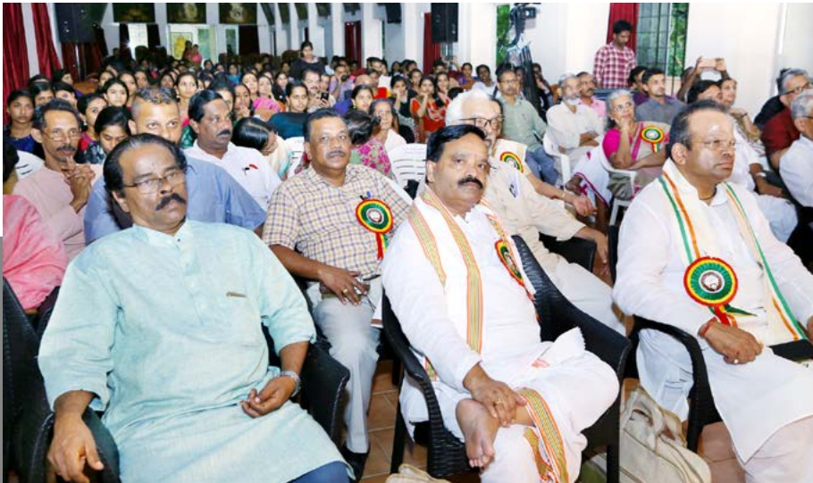
► The Vice- Chancellors and the other delegatas attending Namami Shankaram

which illustrate assorted episodes of the life of Sree Sankaracharya. Further, the dance-form depicted Ar-dhanareeshwara stotram, and Soundarya Lahari, a famous literary work in Sanskrit believed to be written by Sree Sankaracharya. The performance also incorporated Bhaja Govindam, a composition by SreeSankaracharya, it's a prayer emphasizing on spiritual developments, and liberation from the cycle of birth and death.