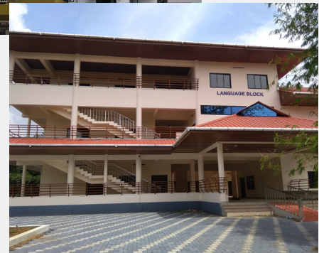
▶ Language Block and Non-Teaching Staff Quarters