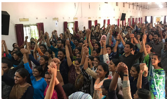
► From the inaugural session of orientation class conducted at the University headquarters, Kalady.