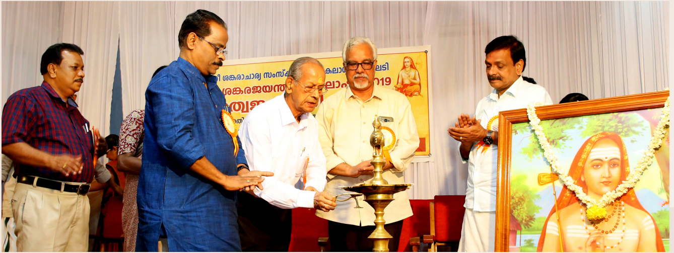
▶ Dr. E Sreedharan inaugurating the Sankara Jayanthi Celebrations