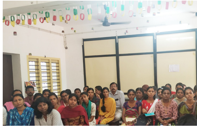
► Orientation class conducted at the Thrissur Regional Centre.