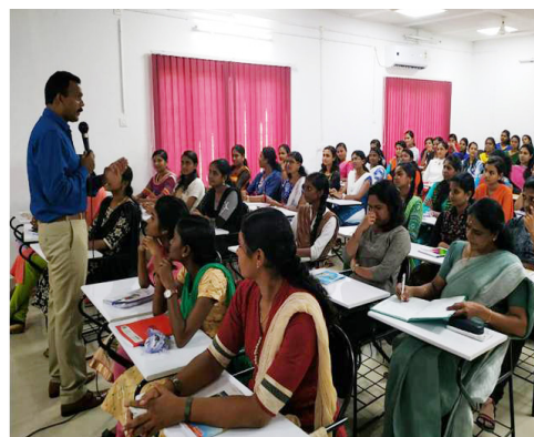
From the orientation class conducted at Ettumanoor Regional Centre. ►