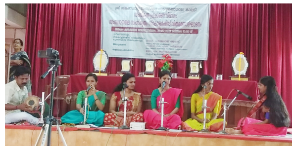
▶ MPhil students from the Department of Music performing 'Sangita Saparya' -a music tribute, as part of the inauguration ceremony.