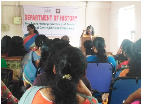
► Students participating in the orientation class conducted at the Thiruvananthapuram Regional Centre.