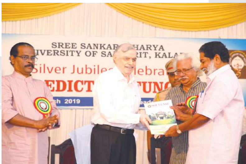
▶ The Governor releasing the Silver Jubilee Sovineir