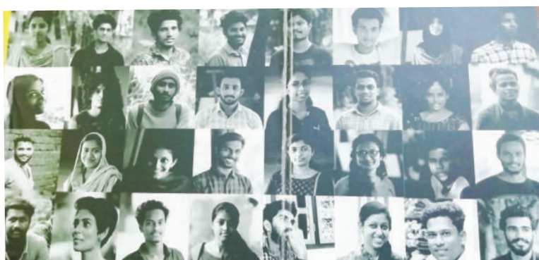
► Students who participated in annual exhibition 2019