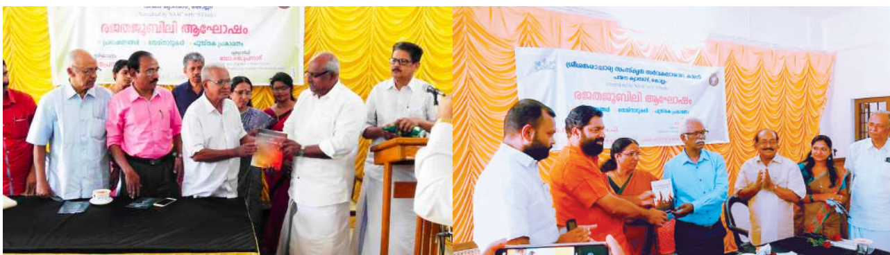
▶ A two-day programme organised by Panmana Regional Campus in-relation with the Silver Jubilee Celebrations contemplating various seminars, talks and book releasing function by eminent personalities.