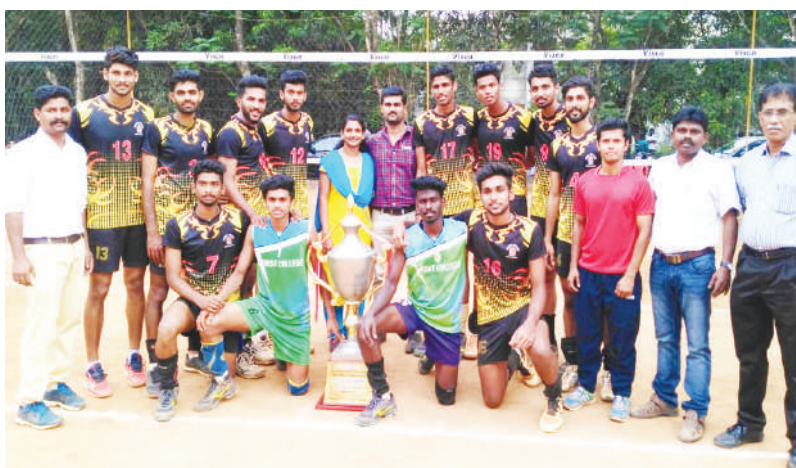
► The winner team of All Kerala Inter Collegiate Volley Ball Tournament in Men's category.