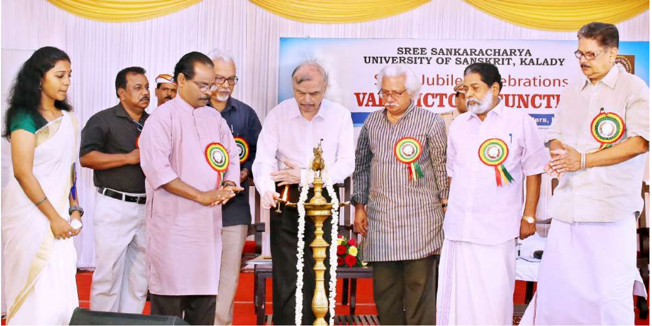
► The Governor and Chancellor of the University Justice (Retd.) P Sathasivam lightening the lamp at the valedictory ceremony.

The Sree Sankaracharya University of Sanskrit, completed its year-long silver jubilee celebrations at the resplendent valedictory function held at the University headquarters at Kalady. Justice (Retd.) P Sathasivam, Governor of Kerala and the Chancellor of University inaugurated the valedictory function on 23 rd of March 2019.