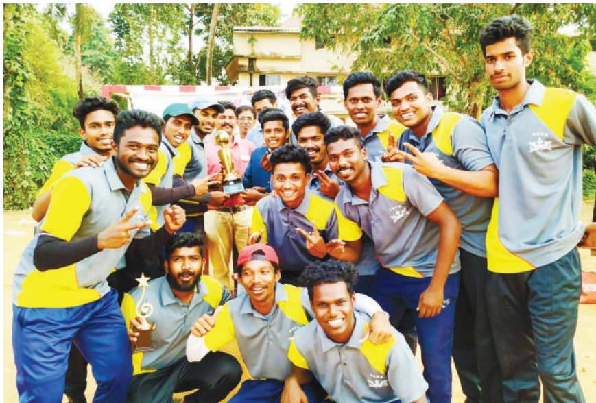
► Winner of the inter-centre cricket championship 2018-19.