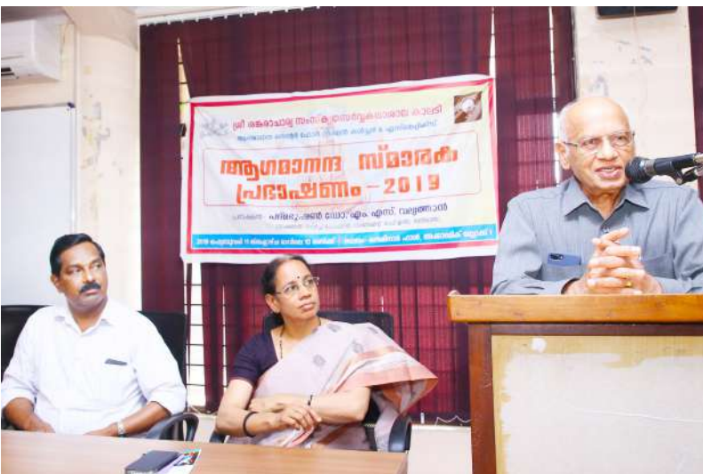
▶ Dr. M S Valiathan speaking during the lecture session.

The Aagamananda Centre for Visual Culture and Aesthetics, conducted Aagamananda Memorial lecture at University Headquarters, Kalady. Veteran scientist Padmavibhushan Dr. M S Valiathan, led the lectures.