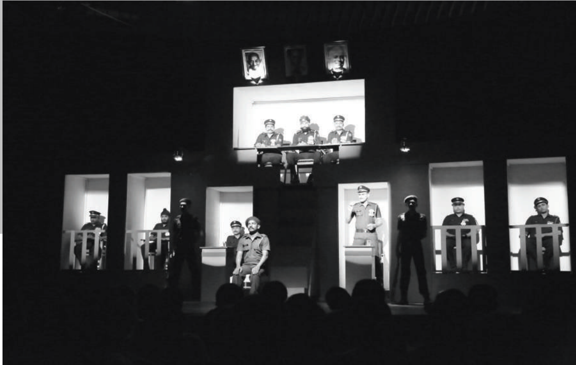
► A scene from the play 'Court Martial'

The Department of Theatre, Sree Sankracharya University of Sanskrit, in-connection with the Silver Jubilee Celebrations, staged the prestigious play written by Swadesh Deepak-'Court Martial'. The plot of the drama outlines the nasty life of army men who are subjected to