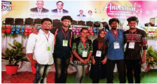
► The winners of Anweshan